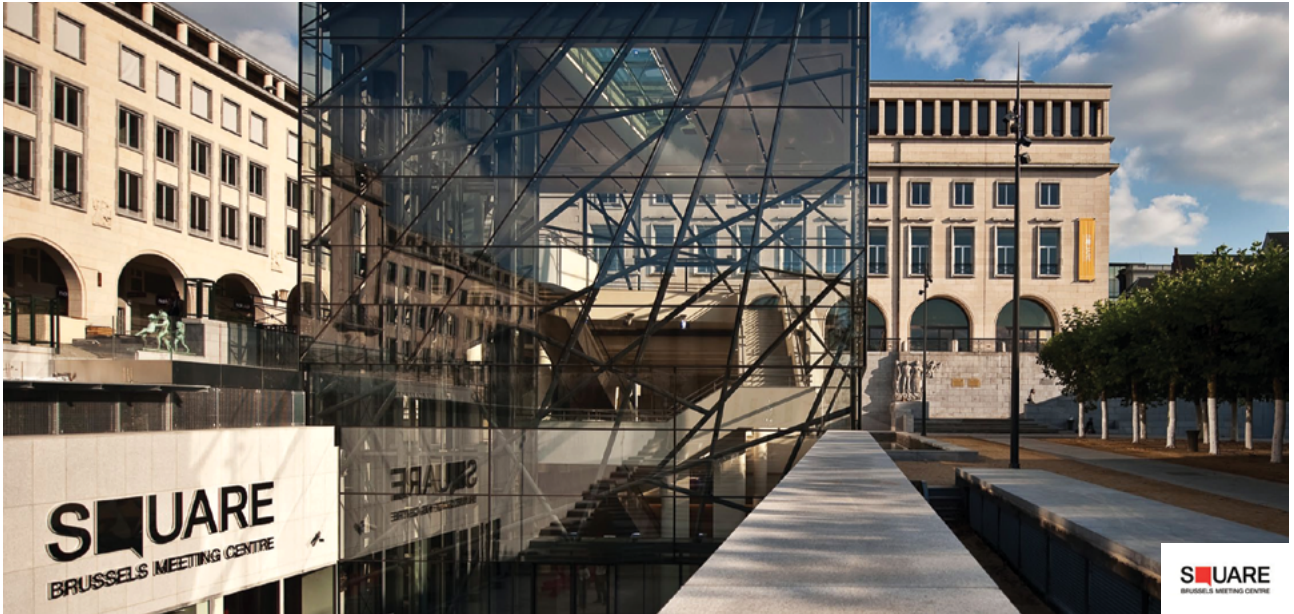
Glass Entrance, Parc du Mont des Arts, 1000 Brussels, Belgium

SQUARE – Brussels Meeting Centre is a centrally located venue of 13.500 m 2 meeting space which is housed in the extensive former Palais des Congrès, an elegant, architecturally significant building originally constructed for the 1958 World Expo.